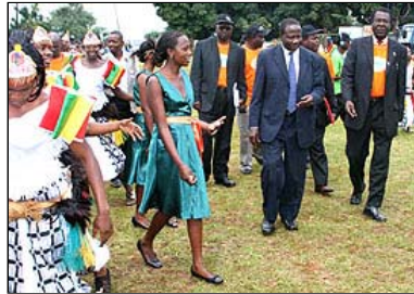
Officials welcoming internal affairs minister Matia Kasajja and Malinga for the launch