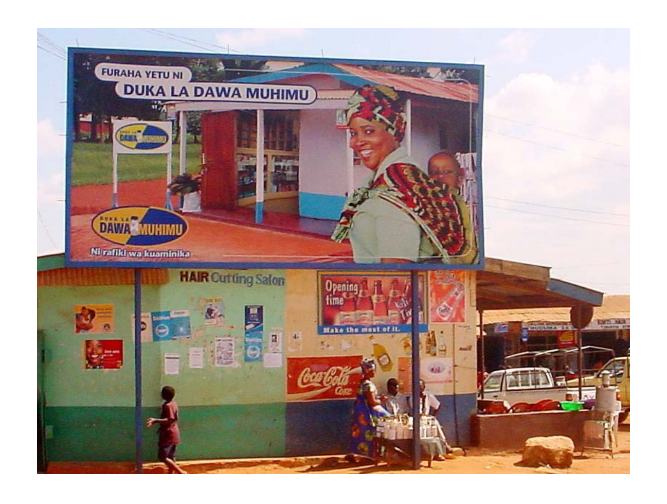
ADDO billboard at the bus stop in Songea fostered public awareness