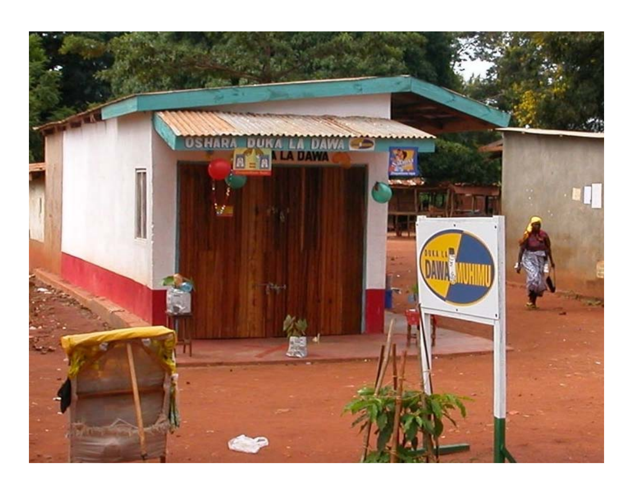
Oshara Duka la dawa Muhimu after conversion